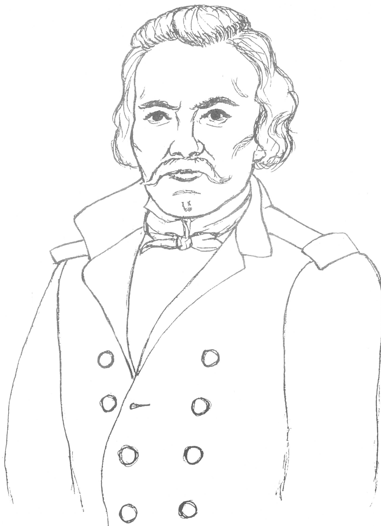
GENERAL ALBERT SIDNEY JOHNSTON