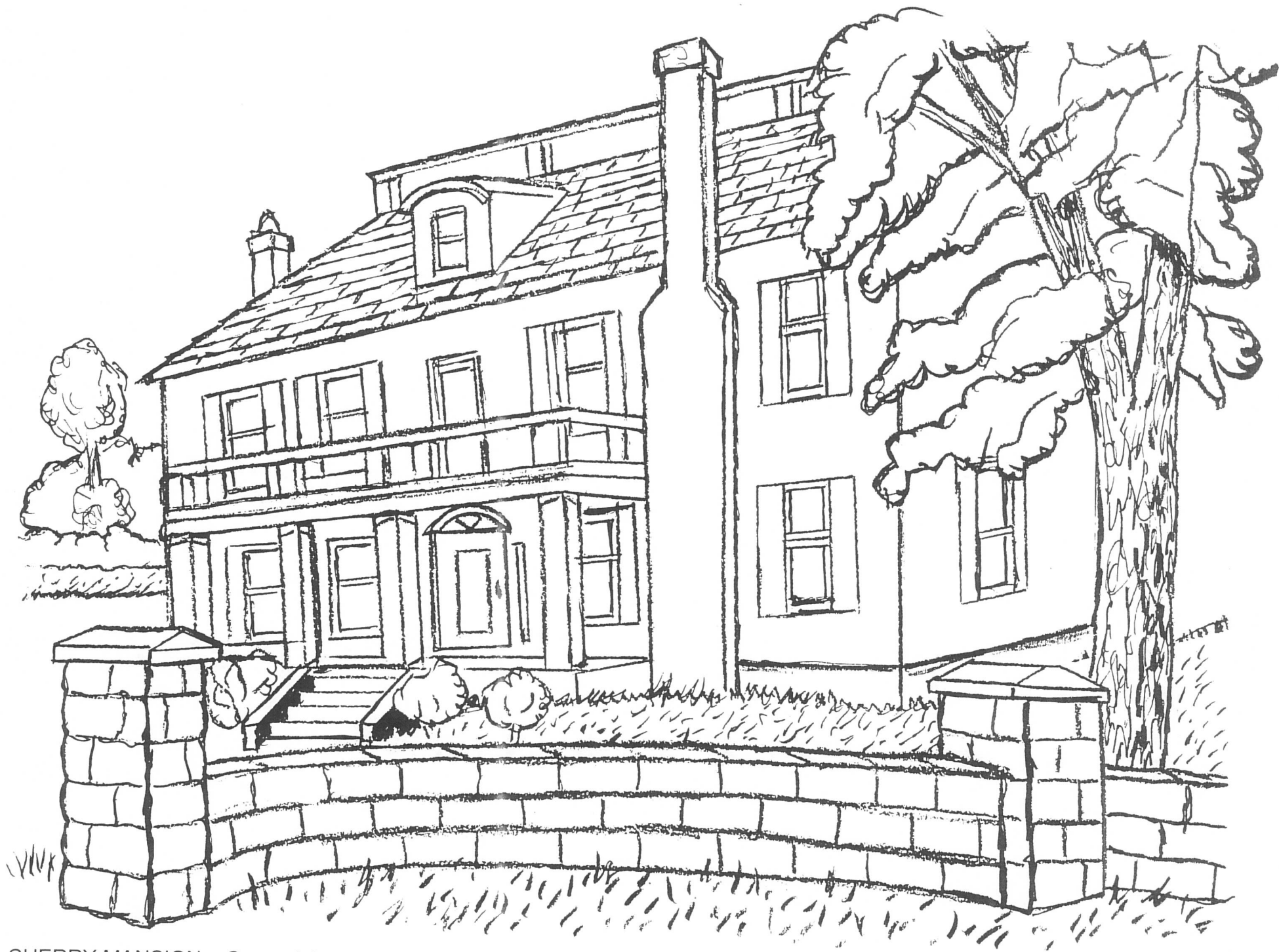
CHERRY MANSION • General Grant's Headquarters during Shiloh Battle